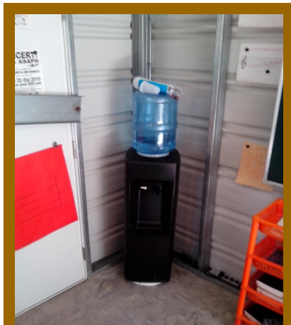
Water cooler for ASAPH students