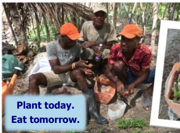
Plant today. Eat tomorrow.