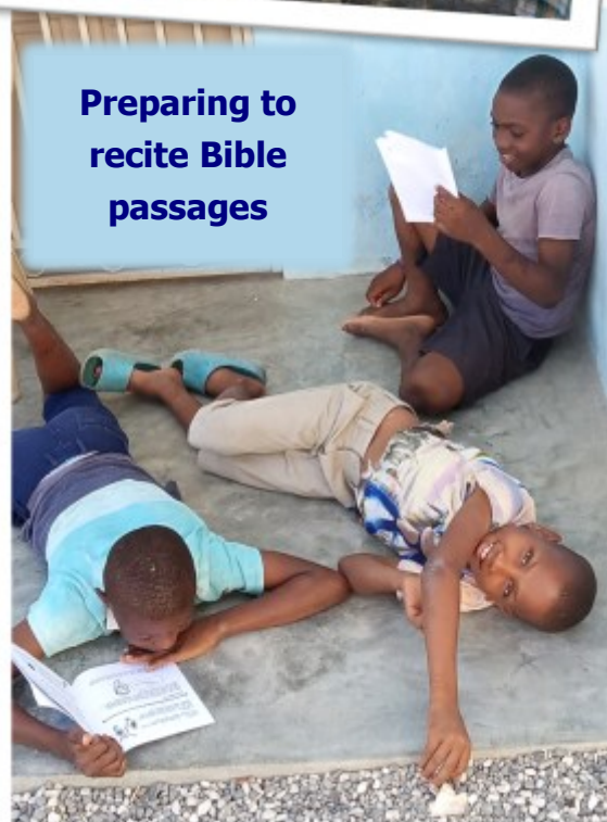
Preparing to recite Bible passages