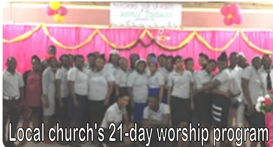
Local church's 21-day worship program