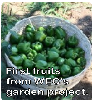
First fruits from WEC's garden project.

The official registration and financial information of Asaph Teaching Ministry may be obtained from the Pennsylvania Department of State by calling toll-free, within Pennsylvania, 1-800-732-0999. Registration does not imply endorsement.